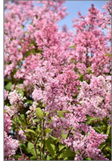
Miss Canada Lilac flowers

Miss Canada Lilac is recommended for the following landscape applications;