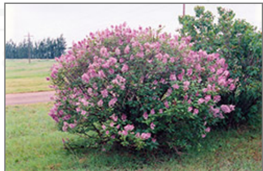
Miss Canada Lilac in bloom