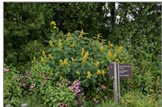
Wild Senna in bloom