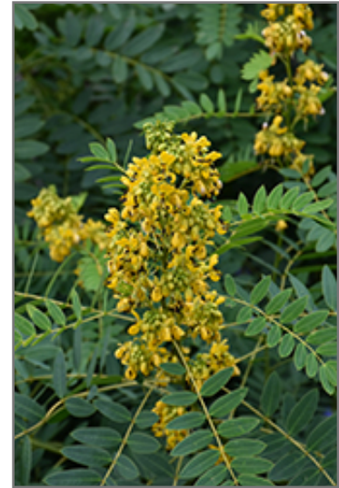
Wild Senna flowers