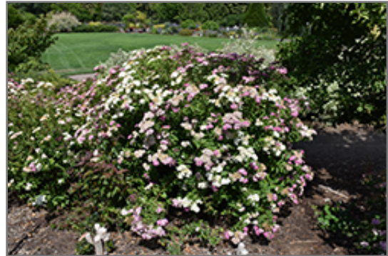
Shirobana Spirea in bloom

Shirobana Spirea is recommended for the following landscape applications;