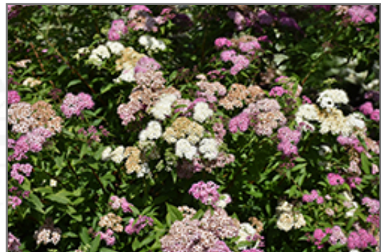
Shirobana Spirea flowers