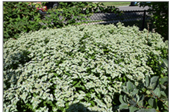
Short Toothed Mountain Mint in bloom