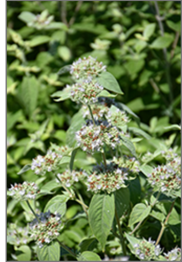
Short Toothed Mountain Mint flowers

Short Toothed Mountain Mint is an herbaceous perennial with an upright spreading habit of growth. Its relatively fine texture sets it apart from other garden plants with less refined foliage.