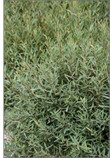
Dwarf Arctic Willow foliage

This shrub should only be grown in full sunlight. It is an amazingly adaptable plant, tolerating both dry conditions and even some standing water. It is not particular as to soil type or pH. It is highly tolerant of urban pollution and will even thrive in inner city environments. This is a selected variety of a species not originally from North America.