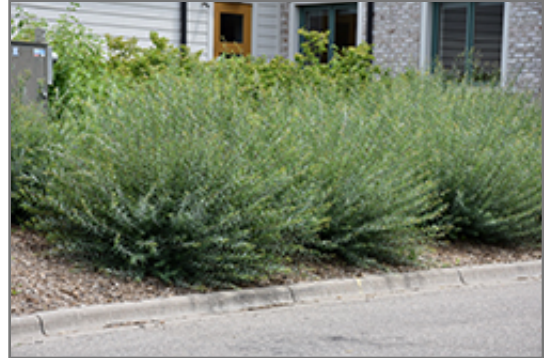
Dwarf Arctic Willow

Dwarf Arctic Willow is recommended for the following landscape applications;