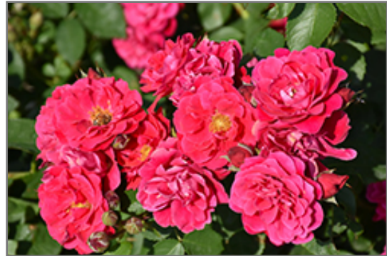
Frontenac Rose flowers

Frontenac Rose is recommended for the following landscape applications;