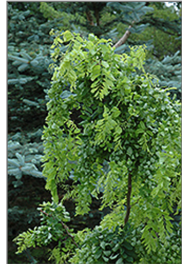
Twisted Baby Black Locust foliage

This shrub does best in full sun to partial shade. It is very adaptable to both dry and moist growing conditions, but will not tolerate any standing water. It is not particular as to soil type or pH, and is able to handle environmental salt. It is highly tolerant of urban pollution and will even thrive in inner city environments. This is a selection of a native North American species.