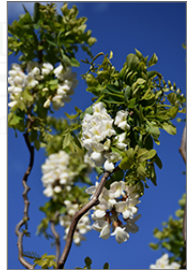
Twisted Baby Black Locust flowers