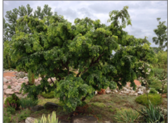
Twisted Baby Black Locust

Twisted Baby Black Locust is a multi-stemmed deciduous shrub with a more or less rounded form. It lends an extremely fine and delicate texture to the landscape composition which can make it a great accent feature on this basis alone.