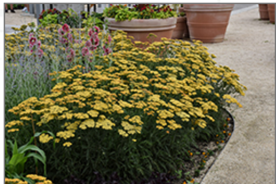
Terra Cotta Yarrow in bloom