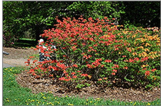
Mandarin Lights Azalea in bloom

This shrub does best in full sun to partial shade. You may want to keep it away from hot, dry locations that receive direct afternoon sun or which get reflected sunlight, such as against the south side of a white wall. It requires an evenly moist well-drained soil for optimal growth, but will die in standing water. It is very fussy about its soil conditions and must have rich, acidic soils to ensure success, and is subject to chlorosis (yellowing) of the foliage in alkaline soils. It is somewhat tolerant of urban pollution, and will benefit from being planted in a relatively sheltered location. Consider applying a thick mulch around the root zone in winter to protect it in exposed locations or colder microclimates. This particular variety is an interspecific hybrid.