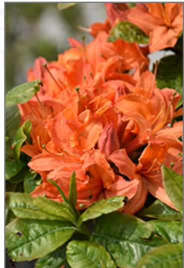
Mandarin Lights Azalea flowers