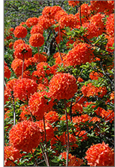
Mandarin Lights Azalea flowers

Mandarin Lights Azalea is recommended for the following landscape applications;