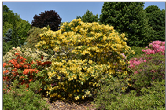
Lemon Lights Azalea in bloom