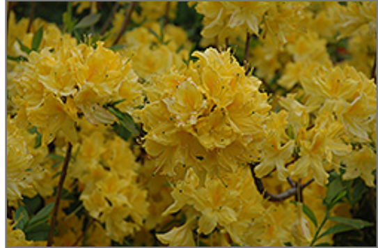
Lemon Lights Azalea flowers