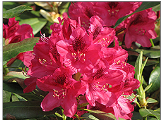
Nova Zembla Rhododendron flowers