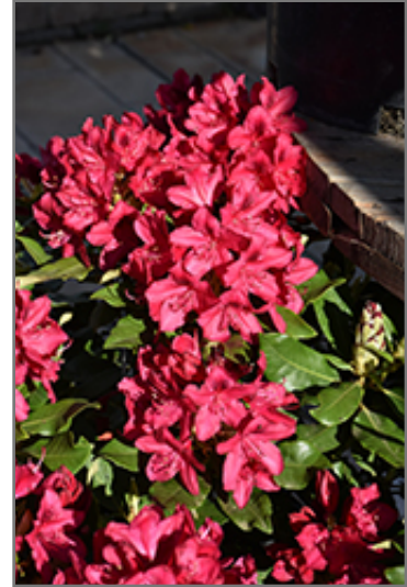
Nova Zembla Rhododendron flowers

This shrub does best in full sun to partial shade. You may want to keep it away from hot, dry locations that receive direct afternoon sun or which get reflected sunlight, such as against the south side of a white wall. It requires an evenly moist well-drained soil for optimal growth, but will die in standing water. It is very fussy about its soil conditions and must have rich, acidic soils to ensure success, and is subject to chlorosis (yellowing) of the foliage in alkaline soils. It is somewhat tolerant of urban pollution, and will benefit from being planted in a relatively sheltered location. Consider applying a thick mulch around the root zone in winter to protect it in exposed locations or colder microclimates. This particular variety is an interspecific hybrid.