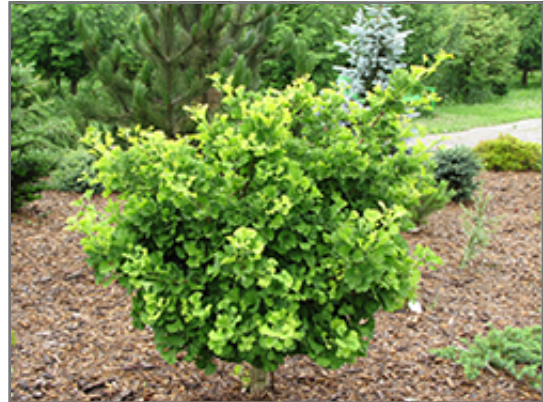
Mariken Dwarf Ginkgo

Mariken Dwarf Ginkgo is recommended for the following landscape applications;