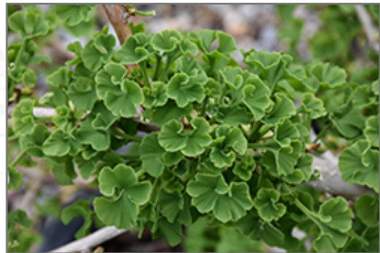
Mariken Dwarf Ginkgo foliage