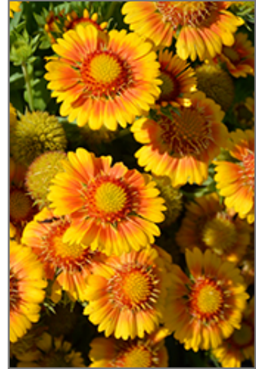
Arizona Apricot Blanket Flower flowers

Arizona Apricot Blanket Flower is a dense herbaceous perennial with a mounded form. Its relatively fine texture sets it apart from other garden plants with less refined foliage.