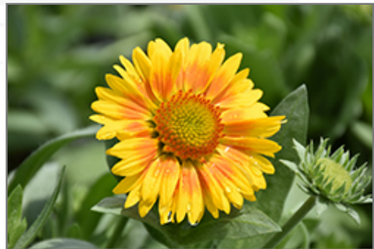
Arizona Apricot Blanket Flower flowers