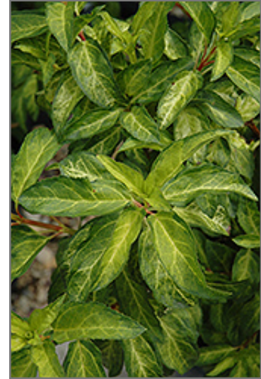
Minigold Forsythia foliage

Minigold Forsythia is recommended for the following landscape applications;