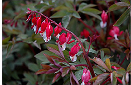
Valentine Bleeding Heart flowers

This plant will require occasional maintenance and upkeep, and should be cut back in late fall in preparation for winter. It is a good choice for attracting butterflies to your yard, but is not particularly attractive to deer who tend to leave it alone in favor of tastier treats. It has no significant negative characteristics.