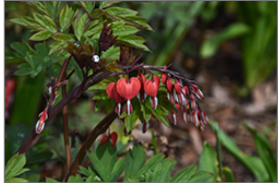
Valentine Bleeding Heart flowers

Valentine Bleeding Heart will grow to be about 30 inches tall at maturity, with a spread of 28 inches. When grown in masses or used as a bedding plant, individual plants should be spaced approximately 24 inches apart. It grows at a medium rate, and under ideal conditions can be expected to live for approximately 15 years. As an herbaceous perennial, this plant will usually die back to the crown each winter, and will regrow from the base each spring. Be careful not to disturb the crown in late winter when it may not be readily seen! As this plant tends to go dormant in summer, it is best interplanted with late-season bloomers to hide the dying foliage.