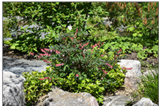
Valentine Bleeding Heart in bloom