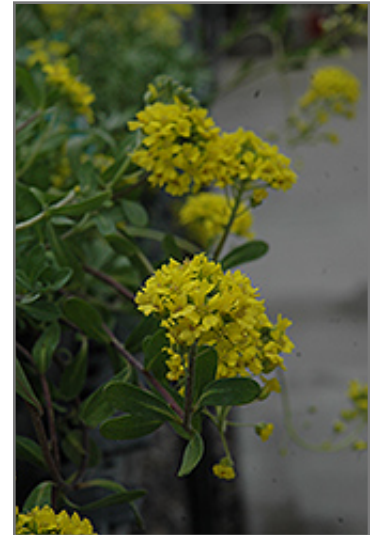
Mountain Gold Aurinia flowers