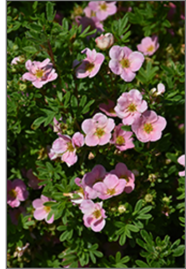
Pink Beauty Potentilla flowers

This is a relatively low maintenance shrub, and is best pruned in late winter once the threat of extreme cold has passed. It is a good choice for attracting butterflies to your yard, but is not particularly attractive to deer who tend to leave it alone in favor of tastier treats. It has no significant negative characteristics.