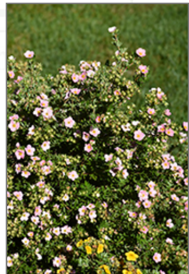
Pink Beauty Potentilla flowers