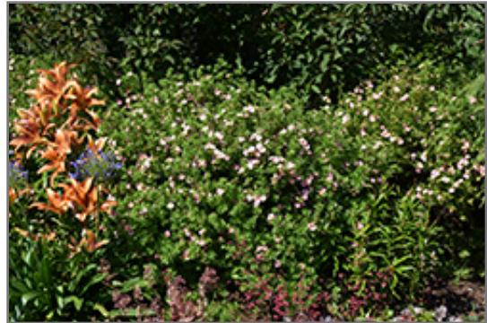
Pink Beauty Potentilla in bloom

This shrub does best in full sun to partial shade. It is very adaptable to both dry and moist locations, and should do just fine under typical garden conditions. It is considered to be drought-tolerant, and thus makes an ideal choice for a low-water garden or xeriscape application. It is not particular as to soil type or pH. It is highly tolerant of urban pollution and will even thrive in inner city environments. This is a selection of a native North American species.