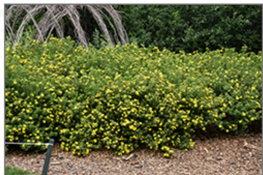
Goldfinger Potentilla in bloom