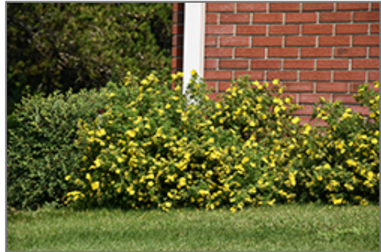
Goldfinger Potentilla in bloom

This shrub does best in full sun to partial shade. It is very adaptable to both dry and moist locations, and should do just fine under typical garden conditions. It is considered to be drought-tolerant, and thus makes an ideal choice for a low-water garden or xeriscape application. It is not particular as to soil type or pH. It is highly tolerant of urban pollution and will even thrive in inner city environments. This is a selection of a native North American species.