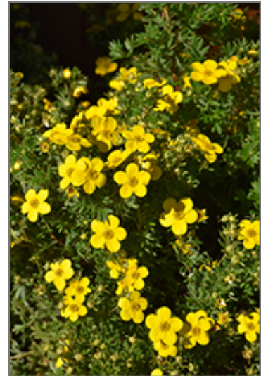
Goldfinger Potentilla flowers

This is a relatively low maintenance shrub, and is best pruned in late winter once the threat of extreme cold has passed. It is a good choice for attracting butterflies to your yard, but is not particularly attractive to deer who tend to leave it alone in favor of tastier treats. It has no significant negative characteristics.