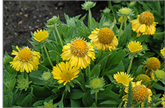
Mesa Yellow Blanket Flower flowers