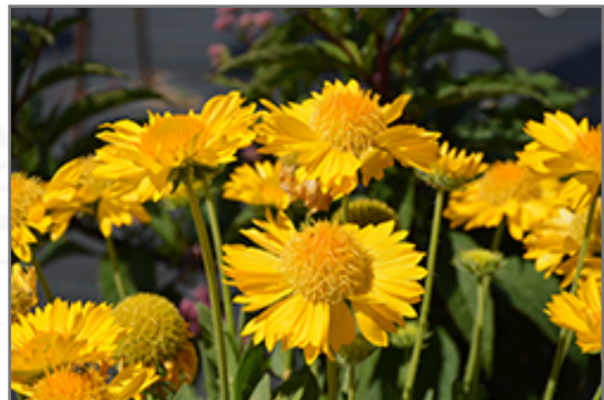
Mesa Yellow Blanket Flower flowers