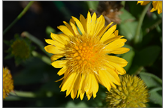
Mesa Yellow Blanket Flower flowers

Mesa Yellow Blanket Flower is a dense herbaceous perennial with a mounded form. Its relatively fine texture sets it apart from other garden plants with less refined foliage.