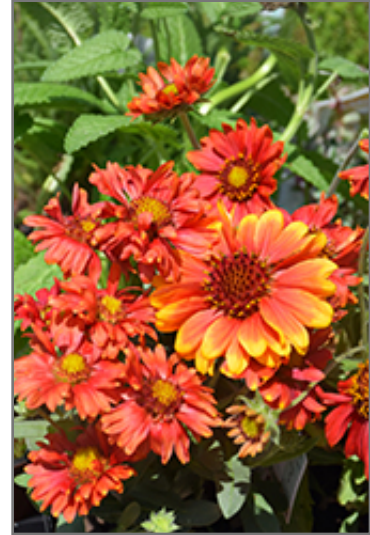
Arizona Red Shades Blanket Flower flowers

Arizona Red Shades Blanket Flower is a fine choice for the garden, but it is also a good selection for planting in outdoor pots and containers. It is often used as a 'filler' in the 'spiller-thriller-filler' container combination, providing a mass of flowers against which the thriller plants stand out. Note that when growing plants in outdoor containers and baskets, they may require more frequent waterings than they would in the yard or garden. Be aware that in our climate, most plants cannot be expected to survive the winter if left in containers outdoors, and this plant is no exception. Contact our experts for more information on how to protect it over the winter months.