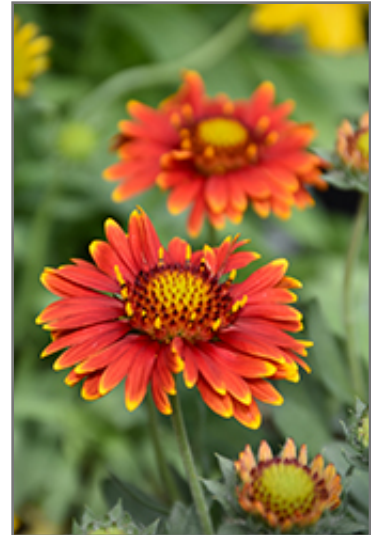
Arizona Red Shades Blanket Flower flowers

Arizona Red Shades Blanket Flower is a dense herbaceous perennial with a mounded form. Its relatively fine texture sets it apart from other garden plants with less refined foliage.