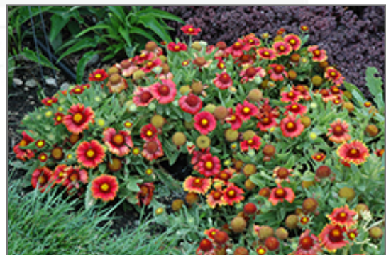
Arizona Red Shades Blanket Flower in bloom