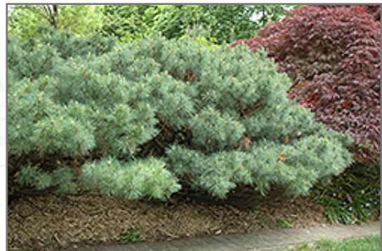
Dwarf White Pine