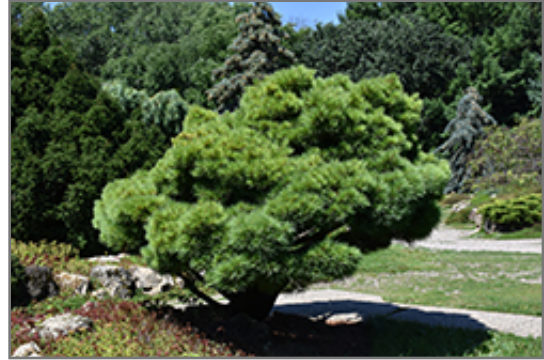
Dwarf White Pine