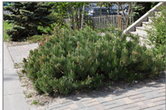
Dwarf Mugo Pine