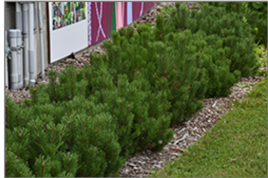
Dwarf Mugo Pine

Dwarf Mugo Pine is recommended for the following landscape applications;