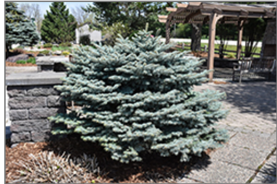
Globe Blue Spruce

Globe Blue Spruce is recommended for the following landscape applications;