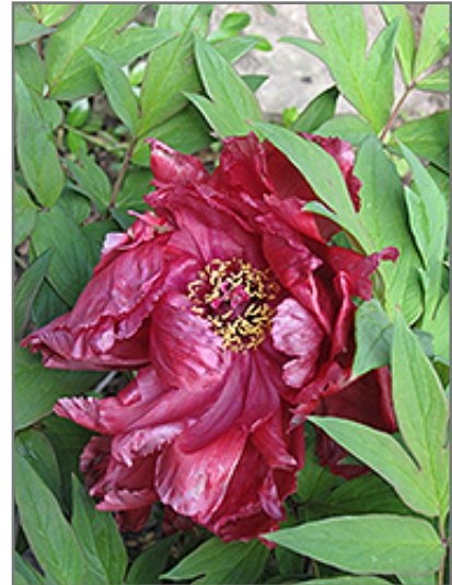
Koukamon Tree Peony flowers