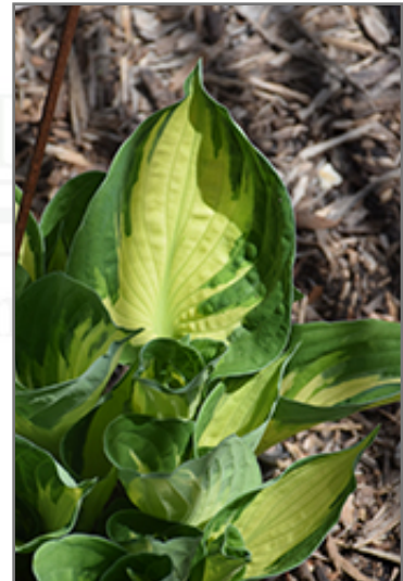
Whirlwind Hosta foliage