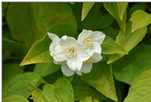
Golden Mockorange flowers

Golden Mockorange is recommended for the following landscape applications;