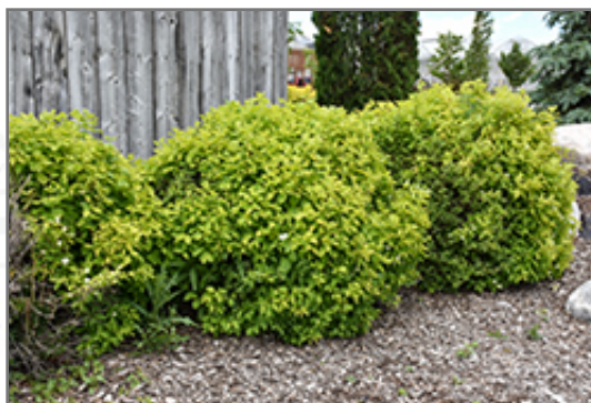
Golden Mockorange