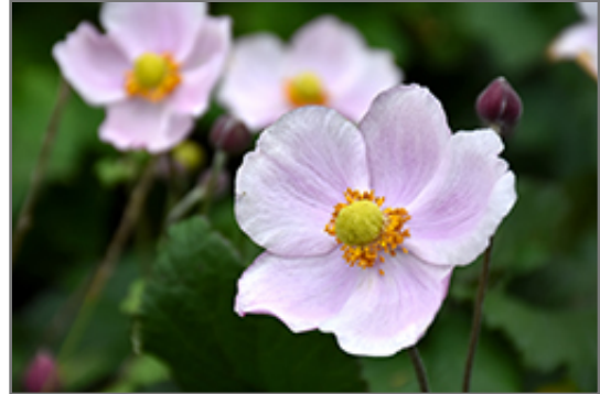
September Charm Anemone flowers

This is a relatively low maintenance plant, and is best cleaned up in early spring before it resumes active growth for the season. It is a good choice for attracting bees and butterflies to your yard, but is not particularly attractive to deer who tend to leave it alone in favor of tastier treats. It has no significant negative characteristics.