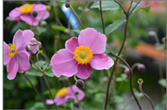
September Charm Anemone flowers

September Charm Anemone will grow to be about 24 inches tall at maturity extending to 3 feet tall with the flowers, with a spread of 3 feet. Its foliage tends to remain dense right to the ground, not requiring facer plants in front. It grows at a medium rate, and under ideal conditions can be expected to live for approximately 10 years. As an herbaceous perennial, this plant will usually die back to the crown each winter, and will regrow from the base each spring. Be careful not to disturb the crown in late winter when it may not be readily seen!