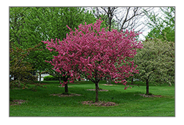
Prairifire Flowering Crab in bloom

Prairifire Flowering Crab is a deciduous tree with an upright spreading habit of growth. Its average texture blends into the landscape, but can be balanced by one or two finer or coarser trees or shrubs for an effective composition.