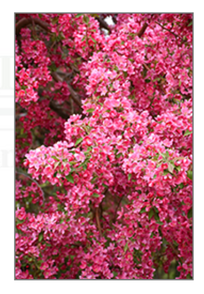
Prairifire Flowering Crab flowers