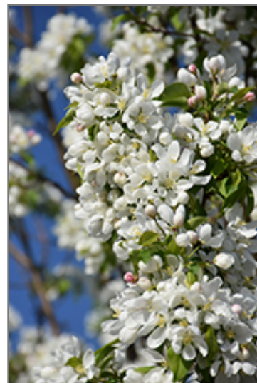
Dolgo Apple flowers

This tree is typically grown in a designated area of the yard because of its mature size and spread. It should only be grown in full sunlight. It prefers to grow in average to moist conditions, and shouldn't be allowed to dry out. It is not particular as to soil type or pH. It is highly tolerant of urban pollution and will even thrive in inner city environments. This particular variety is an interspecific hybrid.