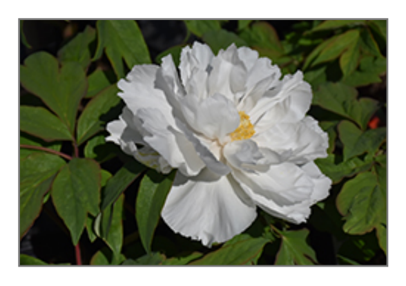
Renkaku Tree Peony flowers

A beautiful woody peony for the garden, with bold snowy white flowers with prominent yellow stamens, great as an accent in the garden or massed in borders; unlike perennial peonies, remember not to prune this variety