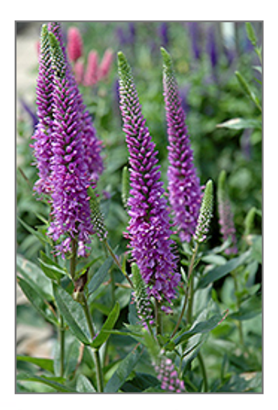
Purpleicious Speedwell flowers

A stunning variety with lovely deep green glossy foliage and magnificent spikes of long lasting radiant purple blooms to dramatically accent sunny borders and rock gardens; deadheading prolongs bloom time