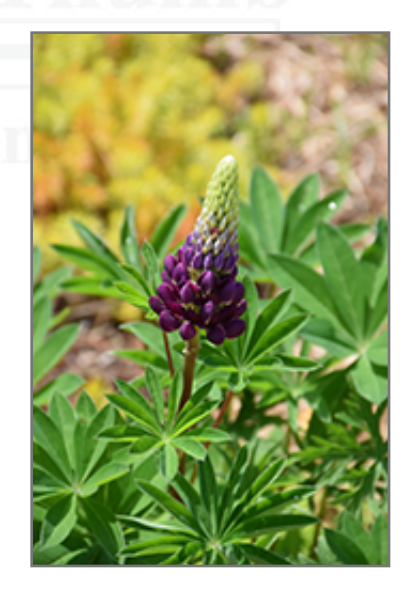
Popsicle Blue Lupine flower buds