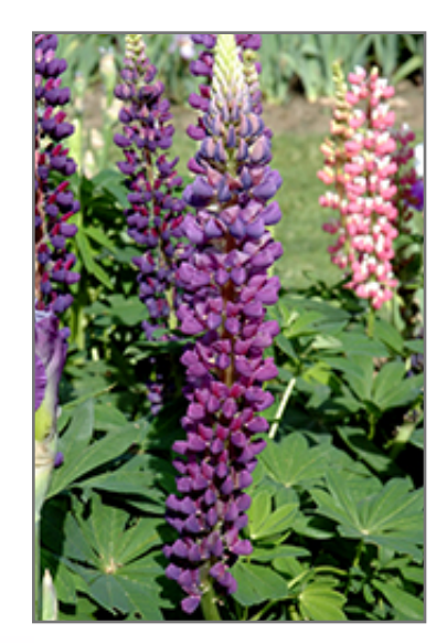
Popsicle Blue Lupine flowers