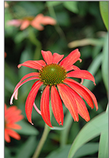
Tomato Soup Coneflower flowers

Tomato Soup Coneflower is an herbaceous perennial with an upright spreading habit of growth. Its medium texture blends into the garden, but can always be balanced by a couple of finer or coarser plants for an effective composition.