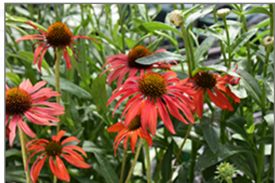
Tomato Soup Coneflower flowers