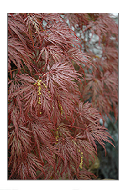
Inaba Shidare Cutleaf Japanese Maple foliage

This is a relatively low maintenance tree, and should only be pruned in summer after the leaves have fully developed, as it may 'bleed' sap if pruned in late winter or early spring. It has no significant negative characteristics.