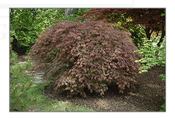
Inaba Shidare Cutleaf Japanese Maple