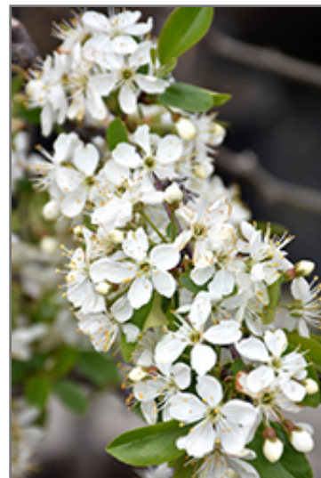
Valentine Cherry flowers

This shrub is typically grown in a designated area of the yard because of its mature size and spread. It should only be grown in full sunlight. It does best in average to evenly moist conditions, but will not tolerate standing water. It is not particular as to soil type or pH. It is highly tolerant of urban pollution and will even thrive in inner city environments. This particular variety is an interspecific hybrid.