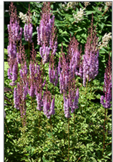
Superba Chinese Astilbe in bloom