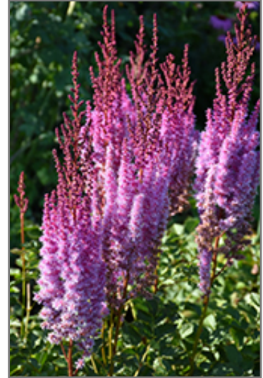
Superba Chinese Astilbe flowers

This is a relatively low maintenance plant, and is best cleaned up in early spring before it resumes active growth for the season. It is a good choice for attracting butterflies to your yard, but is not particularly attractive to deer who tend to leave it alone in favor of tastier treats. It has no significant negative characteristics.