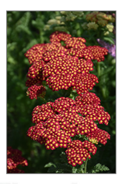
Strawberry Seduction Yarrow flowers Photo courtesy of NetPS Plant Finder

This is a high maintenance plant that will require regular care and upkeep, and is best cleaned up in early spring before it resumes active growth for the season. It is a good choice for attracting bees, butterflies and hummingbirds to your yard, but is not particularly attractive to deer who tend to leave it alone in favor of tastier treats. Gardeners should be aware of the following characteristic(s) that may warrant special consideration;