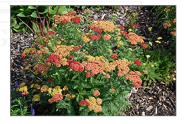
Strawberry Seduction Yarrow in bloom