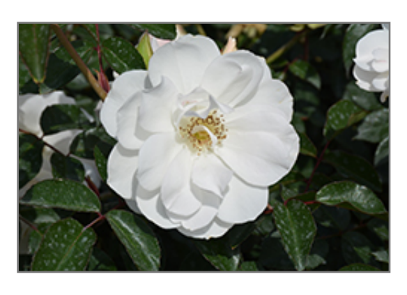
Iceberg Rose flowers

This shrub will require occasional maintenance and upkeep, and is best pruned in late winter once the threat of extreme cold has passed. Gardeners should be aware of the following characteristic(s) that may warrant special consideration;