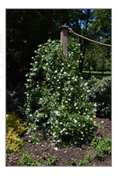
Iceberg Rose in bloom