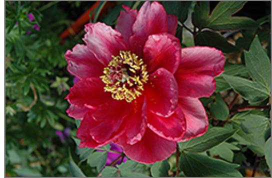
Shimanishiki Tree Peony flowers