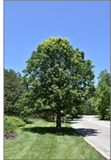
Bur Oak

Bur Oak is a dense deciduous tree with a more or less rounded form. Its relatively coarse texture can be used to stand it apart from other landscape plants with finer foliage.