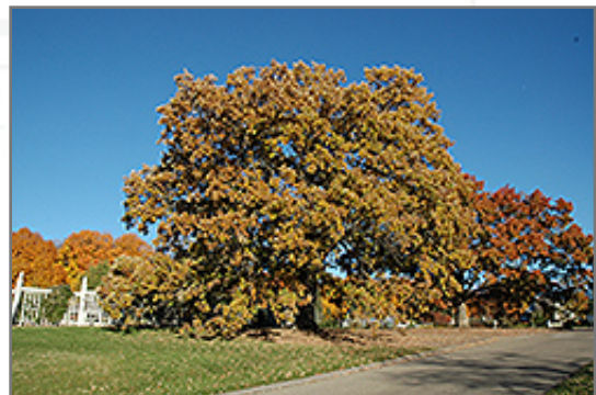
Bur Oak in fall