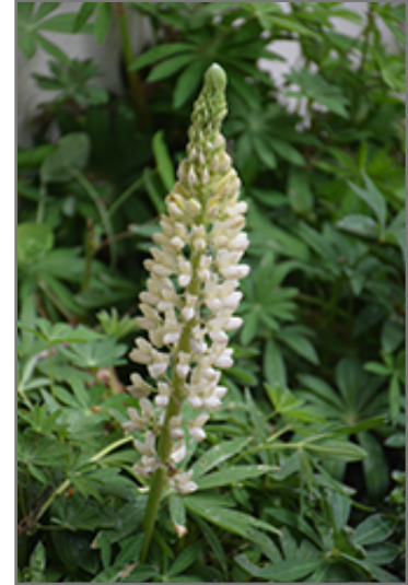
Popsicle White Lupine flowers

This dwarf hybrid produces solid spikes of white flowers rising above fan-shaped leaves; visual stunning in the garden, border plantings or containers