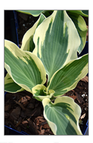
Firn Line Hosta

A strong growing Hosta that quickly forms an attractive and full clump; deeply veined blue green foliage with wide margins, maturing to snowy white; spikes of pale lavender flowers appear in mid-summer; protect from hot afternoon sun