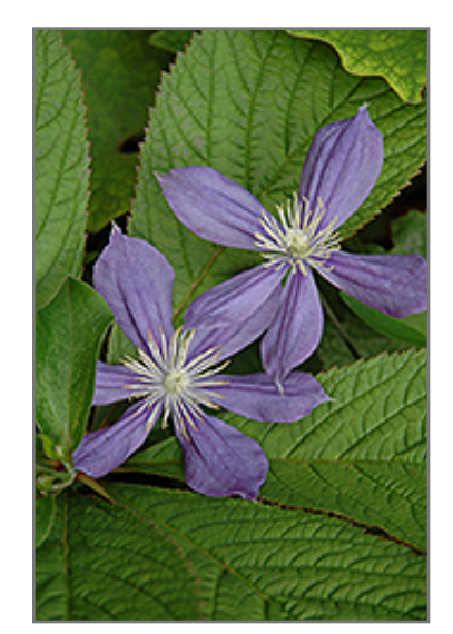
Arabella Clematis flowers

This variety provides an abundance of medium-sized flowers in a wonderful powdery blue color with brightly contrasting centers, one of the heaviest bloomers; more like a perennial than a vine, tends to mound, makes a great groundcover in the garden