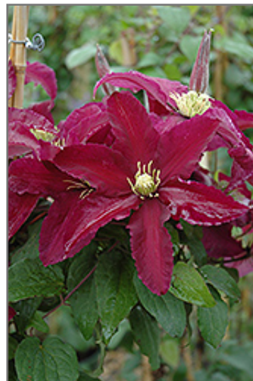
Niobe Clematis flowers