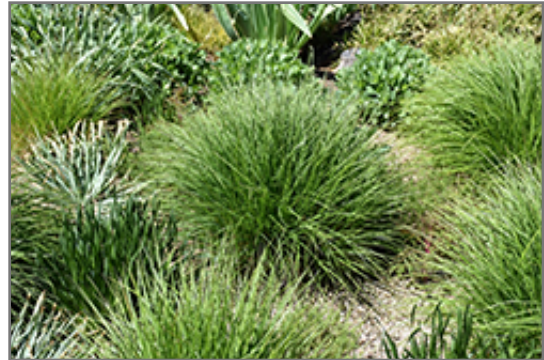
Autumn Moor Grass