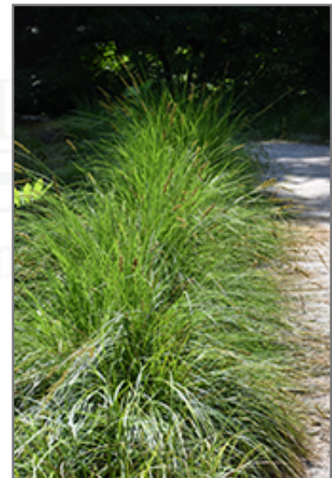
Autumn Moor Grass