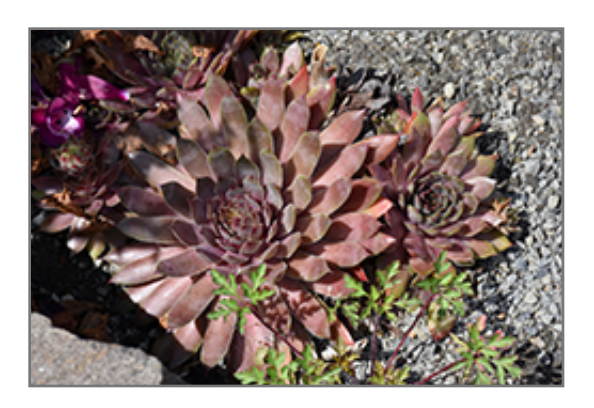
Kalinda Hens And Chicks

Kalinda Hens And Chicks is a dense herbaceous perennial with tall flower stalks held atop a low mound of foliage. Its relatively fine texture sets it apart from other garden plants with less refined foliage.