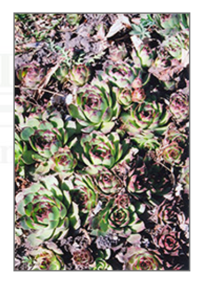
Kalinda Hens And Chicks