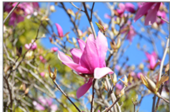
Betty Magnolia flowers