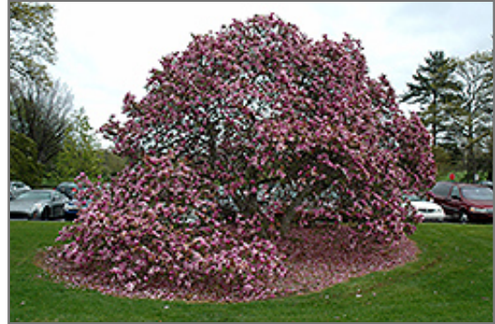
Betty Magnolia in bloom

Betty Magnolia is recommended for the following landscape applications;