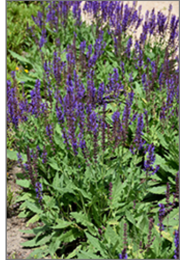
Blue By You Meadow Sage in bloom

This is a relatively low maintenance plant, and is best cleaned up in early spring before it resumes active growth for the season. It is a good choice for attracting butterflies and hummingbirds to your yard, but is not particularly attractive to deer who tend to leave it alone in favor of tastier treats. It has no significant negative characteristics.