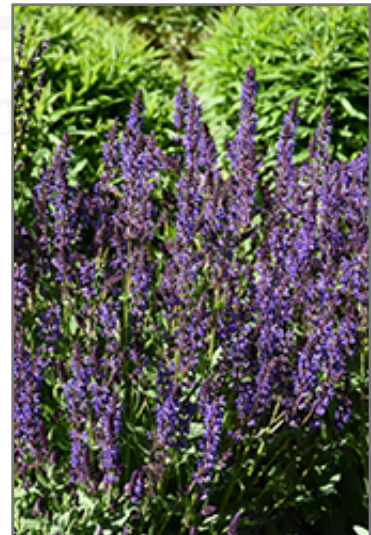
Blue By You Meadow Sage flowers