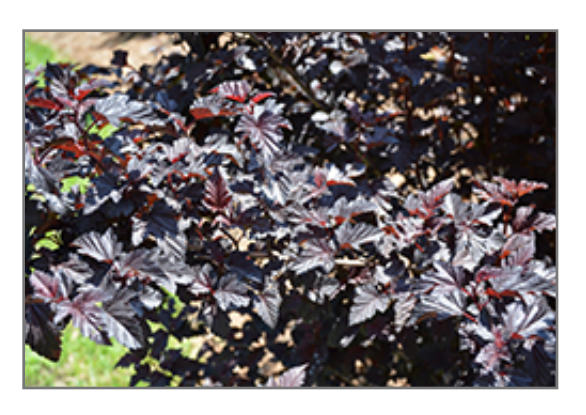
Summer Wine Black Ninebark foliage

Summer Wine Black Ninebark is recommended for the following landscape applications;