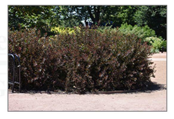
Summer Wine Black Ninebark