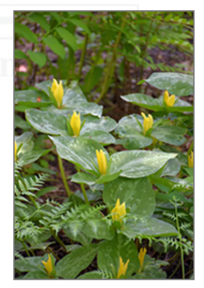
Yellow Trillium flowers