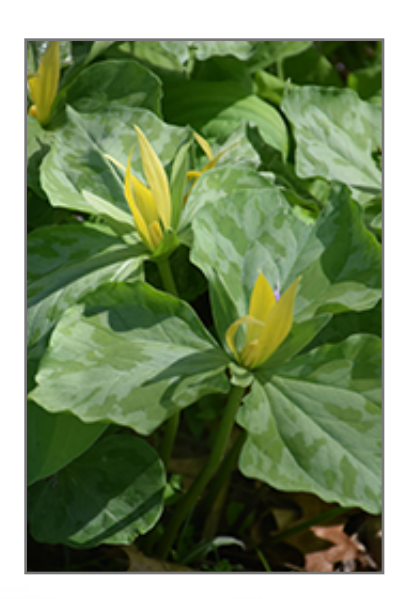
Yellow Trillium flowers